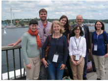
CEPS-Teilnehmende an der ISTR

During the summer, CEPS researchers were able to attend a number of conferences to present their newest research findings and intensify collaboration with their international project partners.