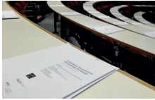
Preparing the workshop

Initiated by the Donors and Foundations Network in Europe (DAFNE) and the French Centre Français des Fonds et Fondations, representatives of corporate foundations from all over Europe assembled for an exchange of experience.